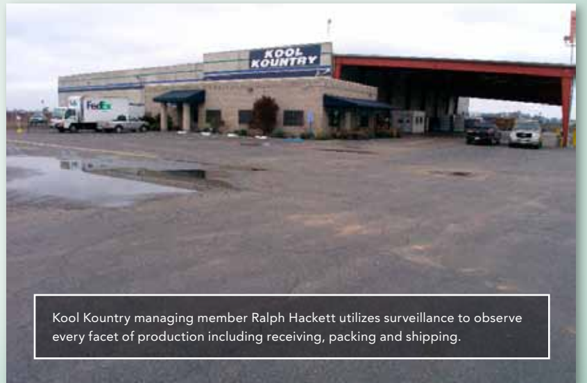
Kool Kountry managing member Ralph Hackett utilizes surveillance to observe every facet of production including receiving, packing and shipping.